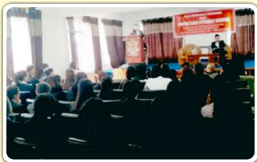
Government Law College, Burtuk.