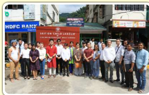
Skit on Child Labour by Sikkim University on 03.09.2019 at Rangpo Bazaar