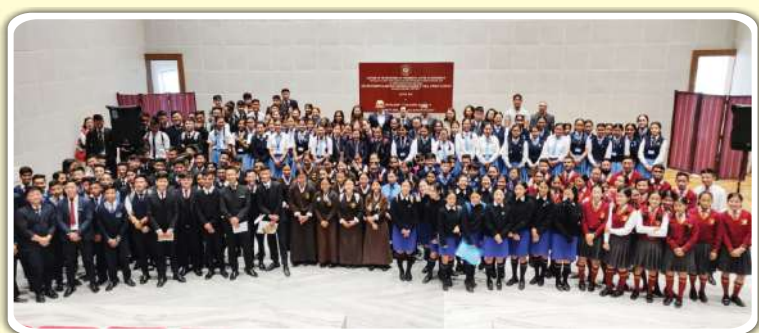
Students of Legal Literacy Clubs in Schools of East District