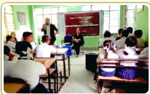
Government Secondary School, Sirwani