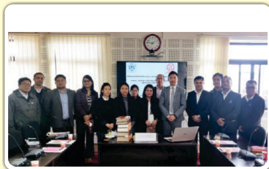
Training Programme for Remand Advocates on 30.09.2019

12 nos. of Remand Advocates were trained during the said programme.