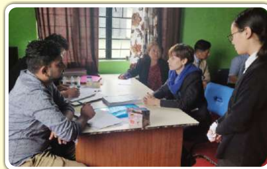
Mission Mode Campaign for Prevention & Eradication of Tuberculosis in all Educational Institutions in Sikkim