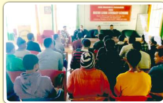
State Central Prison, Rongyek.