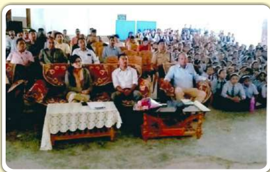
Government Secondary School, Pakki Gaon