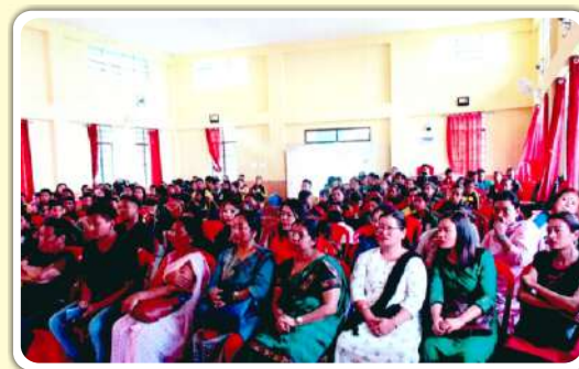
Government Secondary School, Soreng