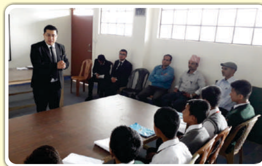
Government Senior Secondary School, Lingchom