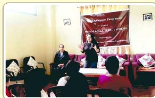
Mamtalaya (Swadhar Greh), Lower Burtuk