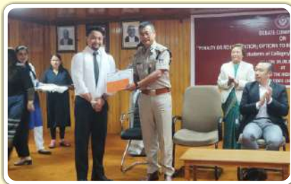
1st Position (ii)