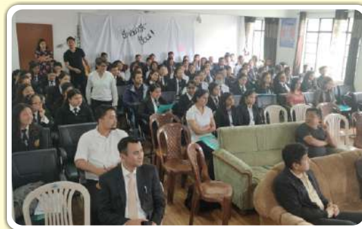
An Awareness Lecture for the Students of College & University on 12 th September, 2019 in the Moot Court Hall of Sikkim Government Law College, Burtuk, East Sikkim.