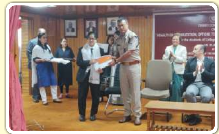
1st Position (i)