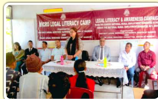
Government Junior High School, Salleybong