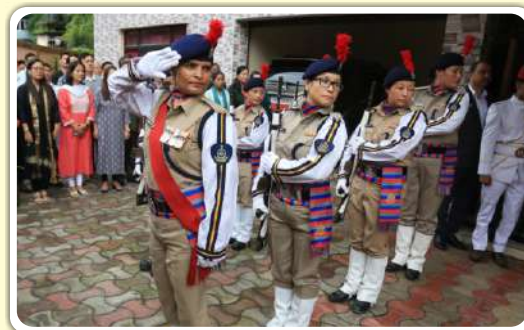
Celebrations of Independence Day in the Office premises at Development Area, Gangtok