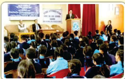
Government Senior Secondary School, Tadong