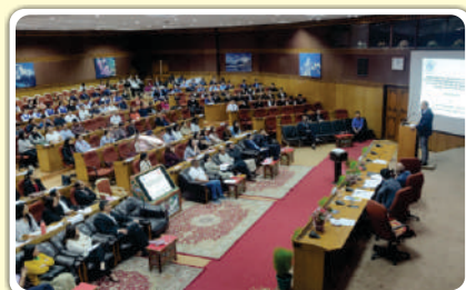
A sensitization programme on Juvenile Justice (Care & Protection of Children) Act, 2015 and POCSO Act, 2012