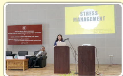
Sensitization Programme on Positive Mental Health for the Employees of Human Resource Development Department, Government of Sikkim on 12 th July, 2019 in the Auditorium of Sikkim Judicial Academy, Sokeythang, East Sikkim.