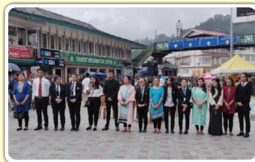
Skit on Child Labour by Sikkim Government Law College on 11.09.2019 at M.G. Marg, Gangtok