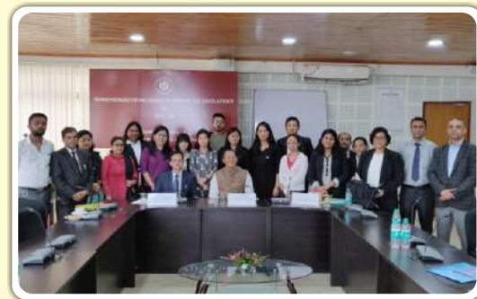
Training Programme for Panel Advocates and members of the Bar on 20 th July, 2019