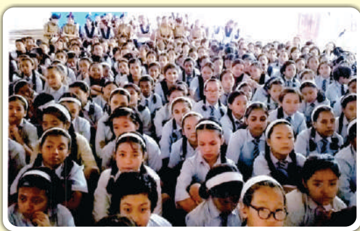
Jawahar Navodaya Vidyalaya, Rothak