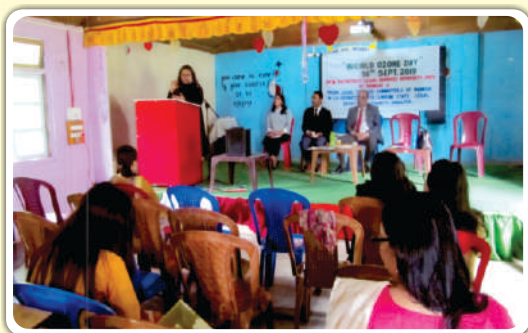
Government Senior Secondary, Maniram