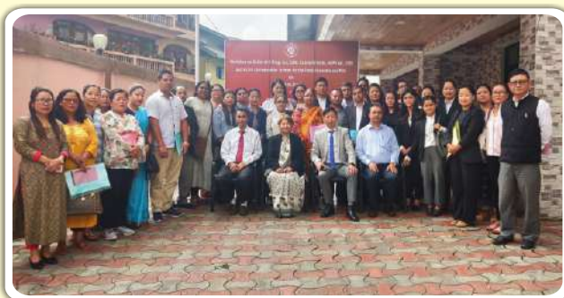
Sensitization programme on SADA, 2006 (as amended), Narcotic Drugs, Psychotropic Substances Act, 1985 and Victim Compensation Scheme (as amended) for Panel Advocates and Para-Legal Volunteers of the East District