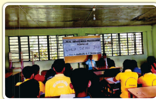
Government Senior Secondary School, Mangan